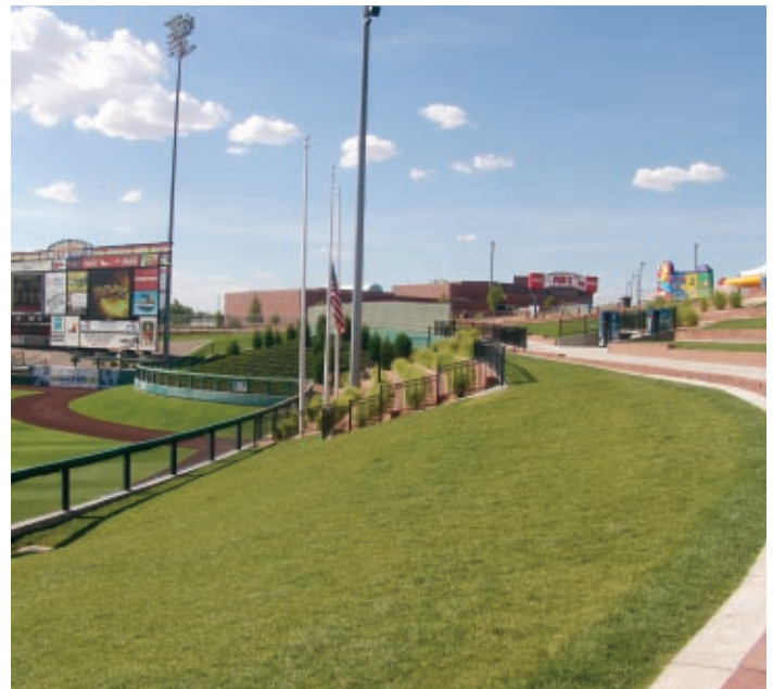
Right: Slopetame 2 protects the Isotopes Park Baseball Stadium, Albuquerque, NM.

*Rebar and U-shaped pins not included with your order.