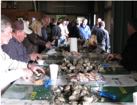
Attendee's shucked their own fresh steamed oysters.

GETSco Ag Services held a Customer Appreciation Luncheon on December 14 th in Middlesex and on December 15 th in Elizabeth City. We had an overwhelming turnout in both locations, with Middlesex serving roughly 200 people and Elizabeth City serving about 100 people. We hope