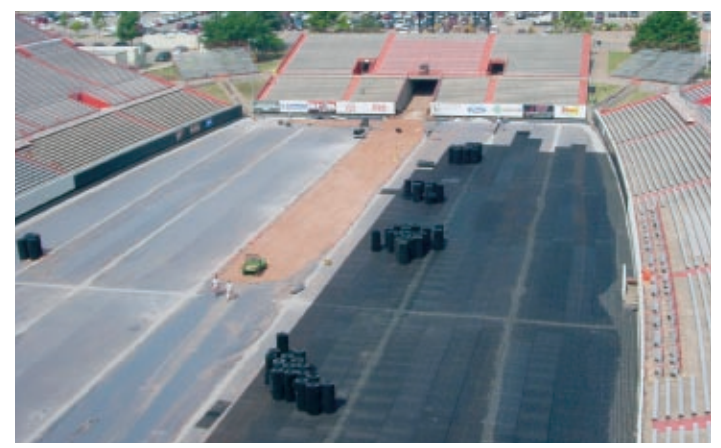
Large-scale drainage (pictured: OSU Boone Pickens Stadium), medium-size green roofs, and small planters all benefit from Draincore<sup>2</sup>'s strength, ease, and efficiency.