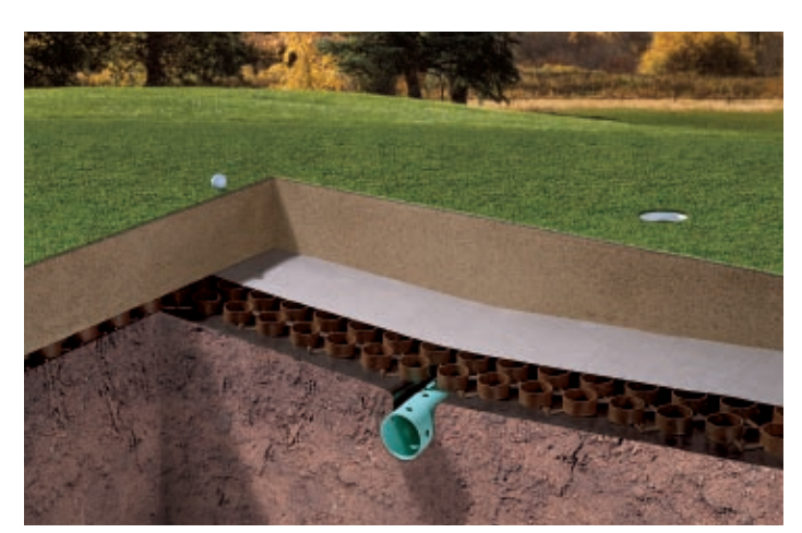
Draincore<sup>2</sup> is highly efficient for moving air and water for healthy vegetation.